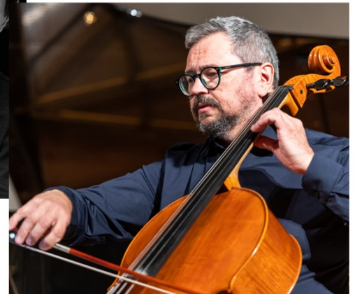
LEONID GOROKHOV CELLO